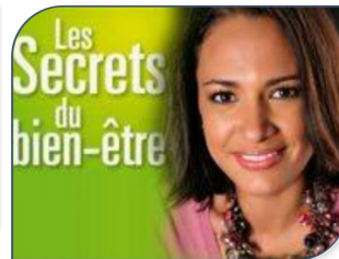
Les secrets du bien-être