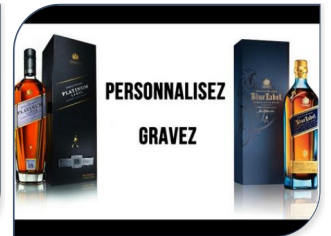
Johnnie walker commercial