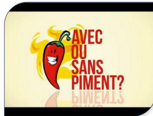
AVEC OU SANS PIMENT